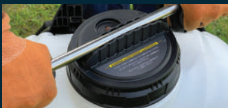
CAP WAND GROOVE FOR TIGHTENING & LOOSENING