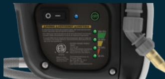
LED BATTERY LIFE INDICATOR