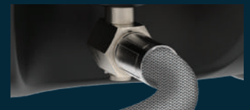
NICKEL-PLATED BRASS SWIVEL HOSE CONNECTION